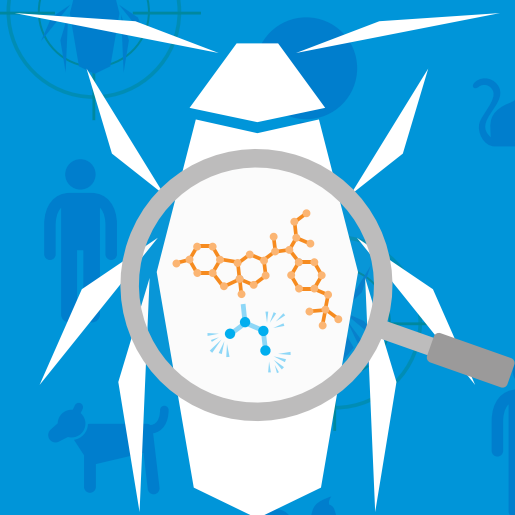
A close-up look at the MetaActive effect working inside a cockroach.

When a pest control service is conducted at your home, you may be wondering about the effects of the treatment process. You can have peace of mind knowing that the Advion family of products and their MetaActive effect are scientifically engineered to maximize their impact on target pests, while minimizing effects on non-target organisms.